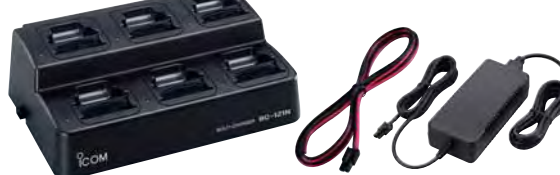
▲ BC-121N+AD-106 (6 pcs.)